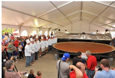
Left—The New Bremen Giant Pumpkin Growers stand with their 20' pie before and after it is baked in the custom designed and built oven.