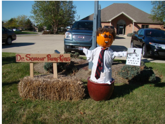
Left: Dr. Semore Pumpkins" (New Bremen Eye Care) winner of the Village People contest sponsored by the SW Auglaize County Chamber of Commerce. Below: South Shore Susie (Coldwell Banker South Shore. Bottom Left: Runners in the Fun Run during Pumpkinfest.

Pumpkin People created and placed in town by local businesses added to the fall decorations put in place by the village parks department..