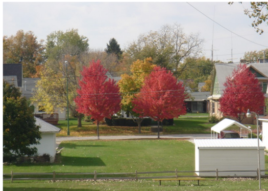
A Crimson and Gold Autumn in New Bremen.