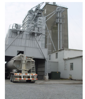
Above: The New Bremen location of Trupointe, Inc., 435 South Herman Street.