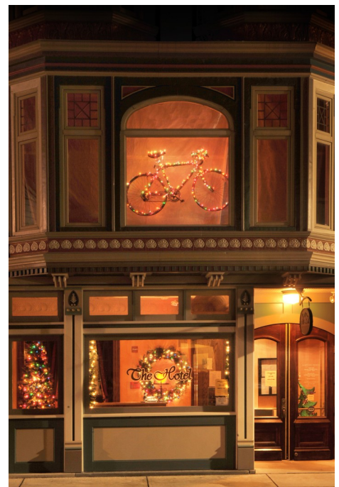
Image featured on the 2010 CIC Christmas Card.