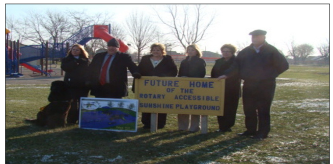
Above: Village officials, and representatives of the NB-NK Rotary Club at the dedication of the Sunshine Playground site at Bremenfest Park.

419-778- 558, visit rotary-sunshineproject.org or "Like" the Sunshine Project on Facebook.