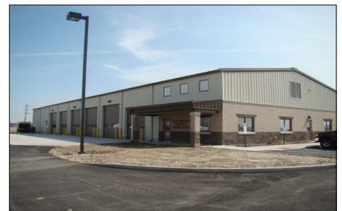
Newly constructed New Bremen Electric Department Building, Streine Drive in the Bunker Hill Industrial Park.